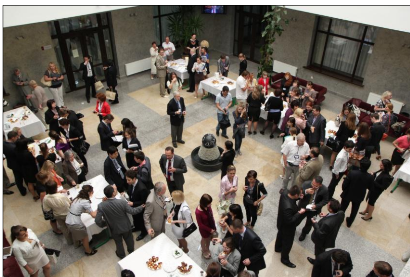
Discussions during coffee-breaks