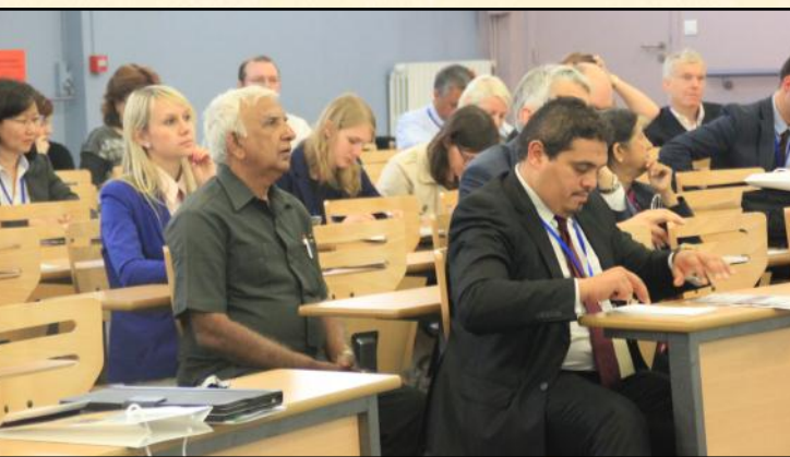
Conference participants during the plenary session