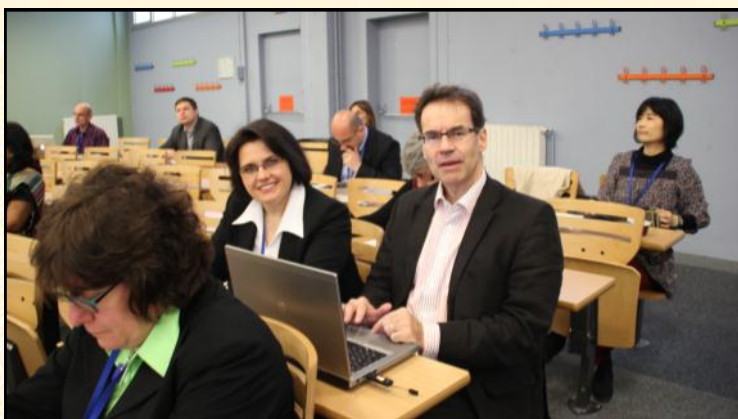
Conference participants during the plenary session