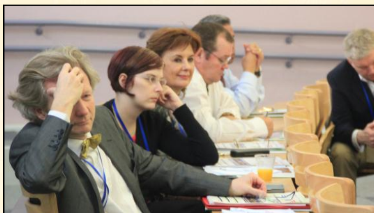
Conference participants during working of parallel sessions