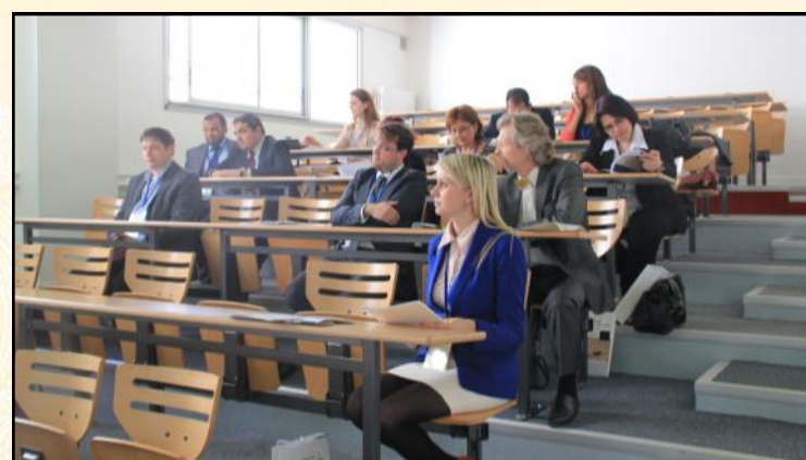
Conference participants during parallel session 3

(France) presented to the audience his view on the new central bank doctrine and central's bank doctrine in the 21st century. After a fundamental overview and analysis of the state of arts in the central banking before and after the financial crisis presenter fixed his attention on a new theory of the modern central banking switching to new objectives, new powers and new governance issues with respect to financial regulation. He concluded that regulative independency must be reinforced, inflation must be defined: consumer inflation and asset inflation, supervision must be enlarged,